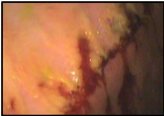
Ulcers in the squamous stomach

10% off Gastroscopy and sedation for the month of October